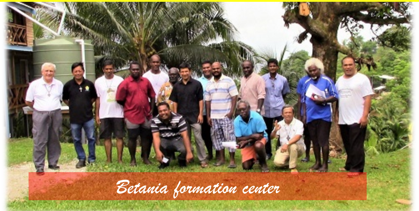
Betania formation center

The Diocese of Gizo has 8 Parishes which are divided into two main division Southern and the northern deanery. Gizo is known as St Peter parish, Noro is named after St Eusibius Parish and Wagina as Sacred Heart Parish. These three are under the southern deanery. Parishes categorised under Northern deanery are as follows, Voruvoru as Christ the King, Sirovanga as St Dominic, Taro as St Don Bosco, Moli as St Joseph, and Nila as the Holy Rosary Parish.